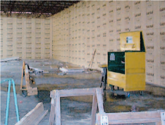
Stud spacing remains accurate, panel to panel, with stud spacing at 16 or 24 inch centers.