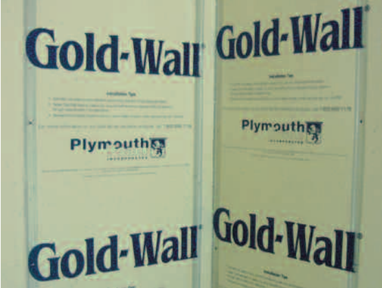
Minor in the field trimming offers the ability to easily float inside drywall corners.