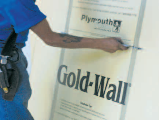
Use a circular saw, utility knife or hot knife to make accurate cuts where you need them.