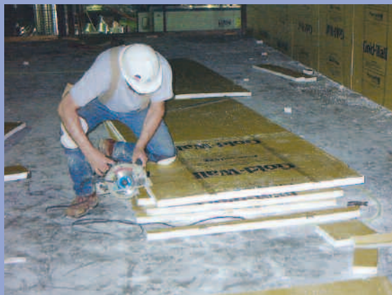
Gold-Wall cuts easily with common tools.