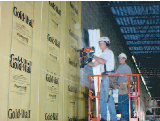
Because Gold-Wall comes in panels with built-in studs, installation is FAST, EASY and ACCURATE.