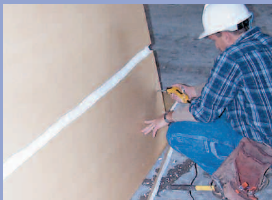
There is no steep learning curve when using Gold-Wall. Voiding out for conduit or cutting out penetrations can be done with a hot knife or common tools.